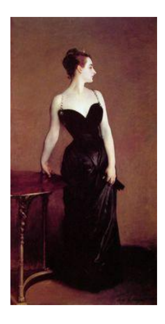
8 Madame X , 1884. John Singer Sargent. Oil on canvas; 234.95 x 109.86 cm. Metropolitan Museum of Art, New York.