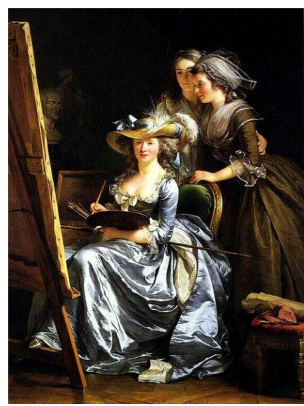
7 Self-Portrait with Two Pupils, 1785. Adélaïde Labille-Guiard. Oil on canvas; 83 x 59 ½ in (210.8 x 151.1 cm). Metropolitan Museum of Art, New York.