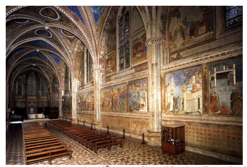
4 Legend of St. Francis, late 13<sup>th</sup> century. Giotto di Bondone. Fresco. Interior, upper church of St. Francis, Assisi.

The size of a painting can be difficult to evaluate, especially since nowadays we often see paintings only as reproductions, in books or online. However, when analyzing a painting, its size is an important factor to keep in mind. Often, the dimensions of a painting are included in its description. Take a moment to look at the size of the painting, and get a mental image of what those dimensions mean. Is it a miniature? Is it life-sized?