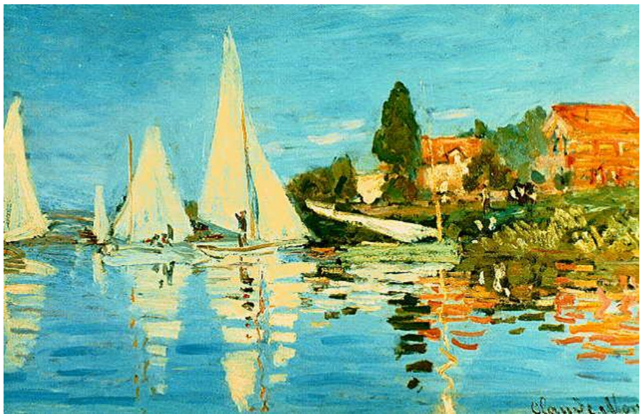
2 The Regatta at Argenteuil (Régate à Argenteuil), 1872. Claude Monet. Oil on canvas; 19 x 29½ in. (48 x 75 cm). Musée d'Orsay, Paris.

In this example, by Claude Monet, the brushstrokes are very obvious. What does this contribute to the mood and effect of the painting?