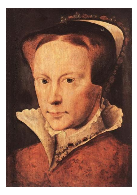
5 Portrait of Mary, Queen of England, c. 1554. Anthonis Mor van Dashorst. Oil on oak panel; 14 1/5 x10 in. (36 x 25.2 cm). Museum of Fine Arts, Budapest.