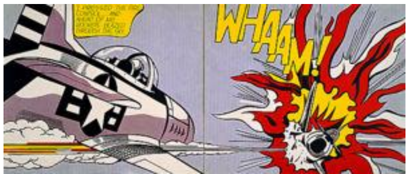
3 Whaam!, 1963. Roy Lichtenstein. Oil and acrylic on canvas; 68 x 161 in. (174.7 x 408.4 cm). Tate Modern, London.