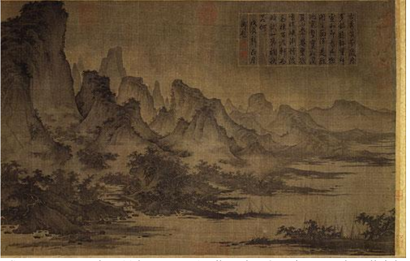
1 Summer Mountains, 11th century. Attributed to Qu Ding. Handscroll; ink and light color on silk; 17 1/2 x 46 in. (44.1 x 116.8 cm). Metropolitan Museum of Art, New York.

This Chinese scroll painting was done on silk. How does that choice of medium affect the appearance of the finished painting?