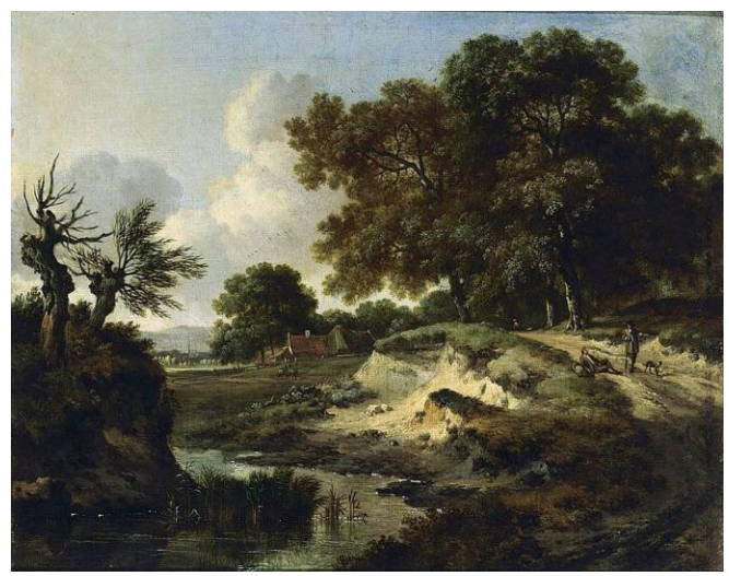
9 Wooded Landscape, 1670s. Jan Wynants. Oil on canvas; 13 x 16 ½ in. (34 x 42 cm). Private Collection.

In landscape painting, the focus is on the scenery—trees, rivers, mountains, fields, sky, etc. While there may be people or animals in the picture they are not the main subject.