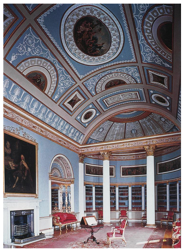
Figure 7: Robert Adam, Kenwood: Middlesex Library (1767-9)