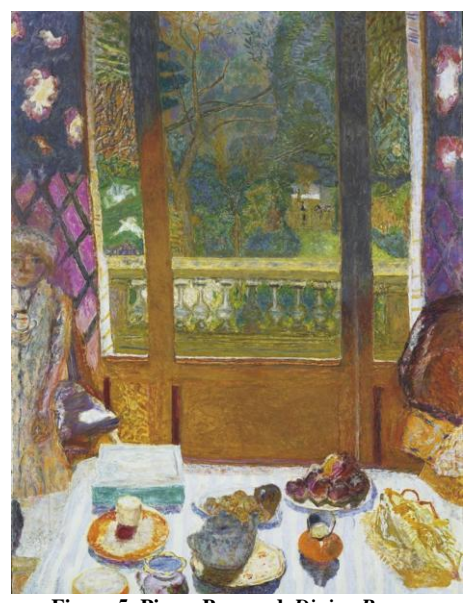
Figure 5: Pierre Bonnard, Dining Room overlooking the Garden (1930-1)

• Use vocabulary words mentioned in class. Foreshortening , linear perspective , and cross-hatching are some examples. Be sure to incorporate only those terms appropriate to your object.