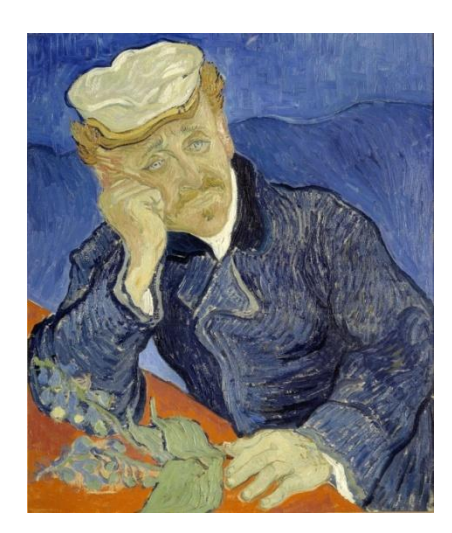
Figure 4: Vincent van Gogh, Dr. Gachet (1890)

• Use vocabulary words mentioned in class. Foreshortening , linear perspective , and cross-hatching are some examples. Be sure to incorporate only those terms appropriate to your object.